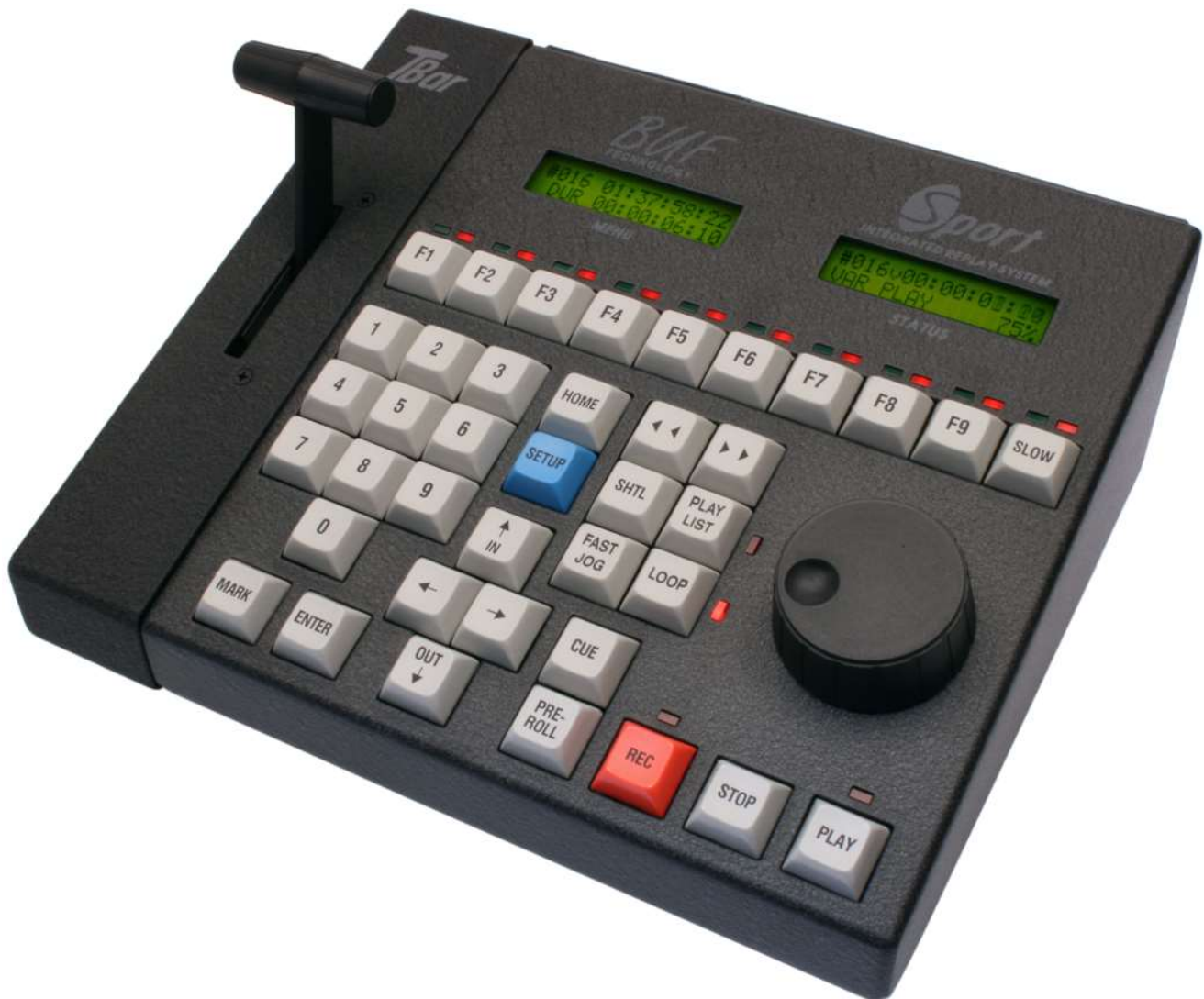
SPORT-EX CONTROL PANEL